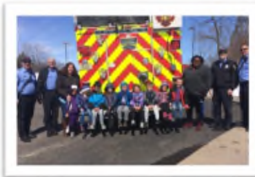
Woods Hollow Daycare