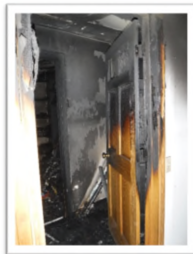
Tudor Drive Structure Fire