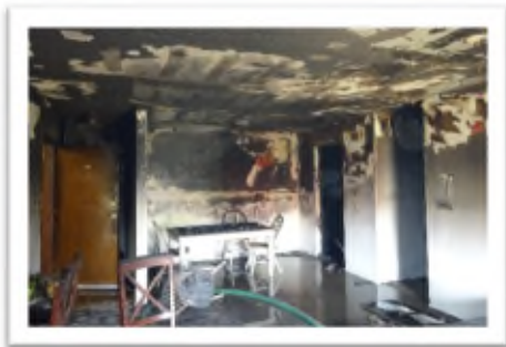
High Ridge Trail Kitchen Fire