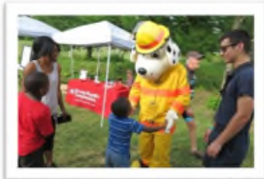
Leopold Community Night

The City of Fitchburg Fire Department promotes fire and life safety education for Fitchburg residents and its visitors through fire education programs and events throughout the year.