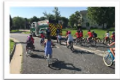
Lacy Heights Bike Parade