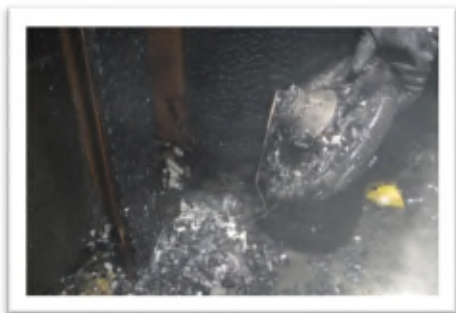
Aztec Trail Structure Fire