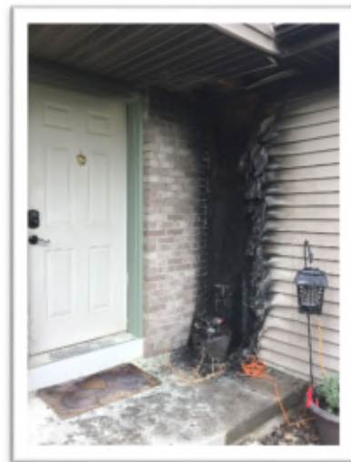
Quartz Drive Structure Fire