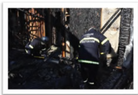
Woods Edge Way Structure Fire

In 2018 there was an estimated total fire loss of just over $2,700,000.